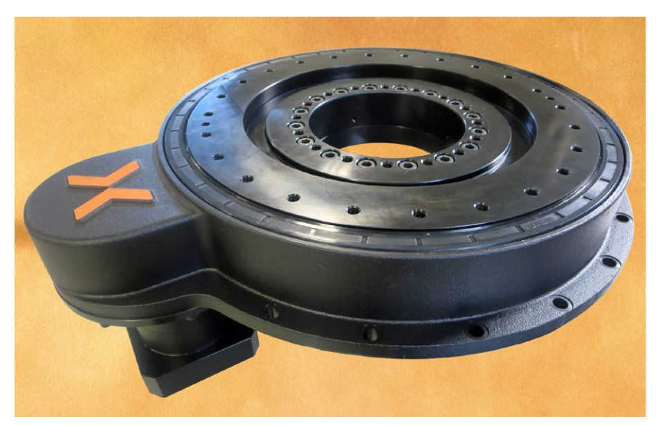
Nexen's CRD Rotary Indexers have an IP65-rated sealed housing and come in three con-figurations, enabling the device to be optimized for high speed, high torque or both, depending on the application.

Rotary indexing tables work well with machines that perform simple, fast, vertical operations, such as presses, screwdrivers, riveters, dispensers, pad printers, SCARA robots, pick-and-place units, and ultrasonic welders. Parts can be loaded and unloaded manually or automatically.